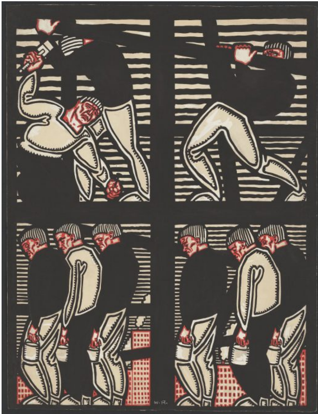
Steelworkers by Winold Reiss (circa 1919). The four-panel composition shows two scenes: steel workers on a beam and walking with lunch buckets.

The workers work early and late, in heat and cold, they sweat and groan and bleed and die — the steel billets they make are caskets. They build the mills and all the machinery; they man the plant and the thing of stone and steel begins to throb. They live in cottages just this side of hovels, where gaunt famine walks with despair and “ Les Miserables ” leer and mock at civilization. When the mills shut down, they are out of work and out of food and out of home; and when old age steals away their vigor and the step is no longer agile, nor the sinew strong, nor the hand quick; when the frame begins to quake and quiver and the eye to grow dim, and they are no longer fit as labor power to make profit for the masters, they are pushed aside into the human drift that empties into the gulf of despair and death.