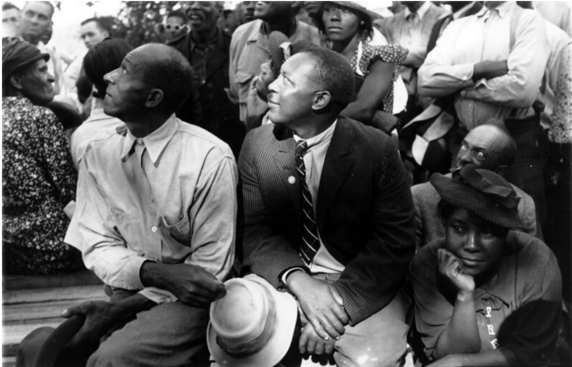
Members of the Socialist-led Southern Tenant Farmers Union at an outdoor meeting in September 1937.

We know that Socialism is necessary to the emancipation of the Working Class and to the true happiness of all classes and that its historic mission is that of a conquering movement. We know that day by day, nourished by the misery and vitalized by the aspirations of the workers, the area of its activity widens, it grows in strength and increases its mental and moral grasp, and when the final hour of Capitalism and wage slavery strikes, the Socialist movement, the greatest in all history — great enough to embrace the human race — will crown the struggles of centuries with victory and proclaim freedom to all mankind.